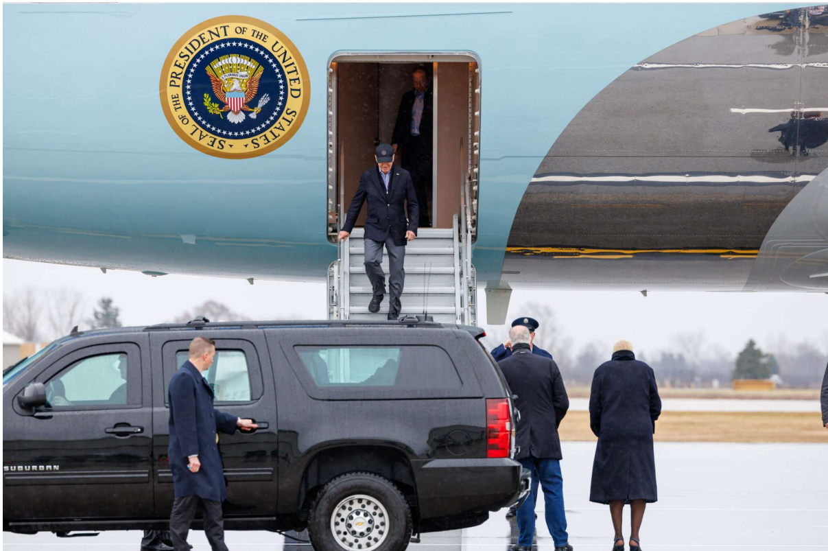
Caption: Credit your images

President Joe Biden returned to Michigan on Thursday, a week after delivering his State of the Union address, for two campaign events in Saginaw.