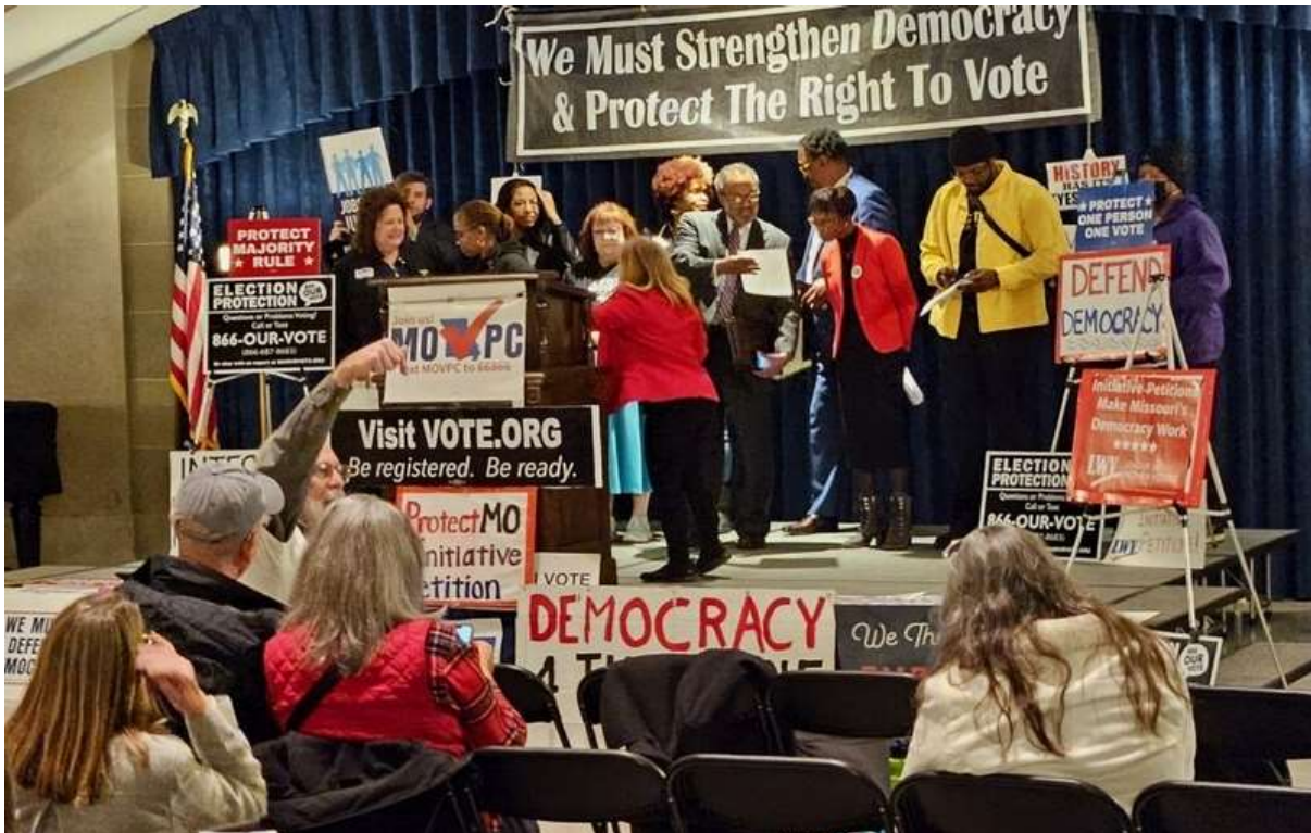
The Missouri Voter Protection Coalition rallied at the State Capitol Tuesday against proposed changes in the majority needed to pass a constitutional amendment.

Hardline conservative lawmakers in Missouri advanced a proposal Tuesday that could make changing the state constitution harder. Missouri Independent reports that the Senate Local Government and Elections Committee voted 5-2 in favor of legislation that would require a proposed constitutional amendment to receive a majority of votes in most House districts in addition to a general statewide majority. The vote followed an overnight filibuster led by the Freedom Caucus over the bill. Republicans are trying to raise the threshold for ballot measures as two efforts to put abortion on the ballot this fall are underway.