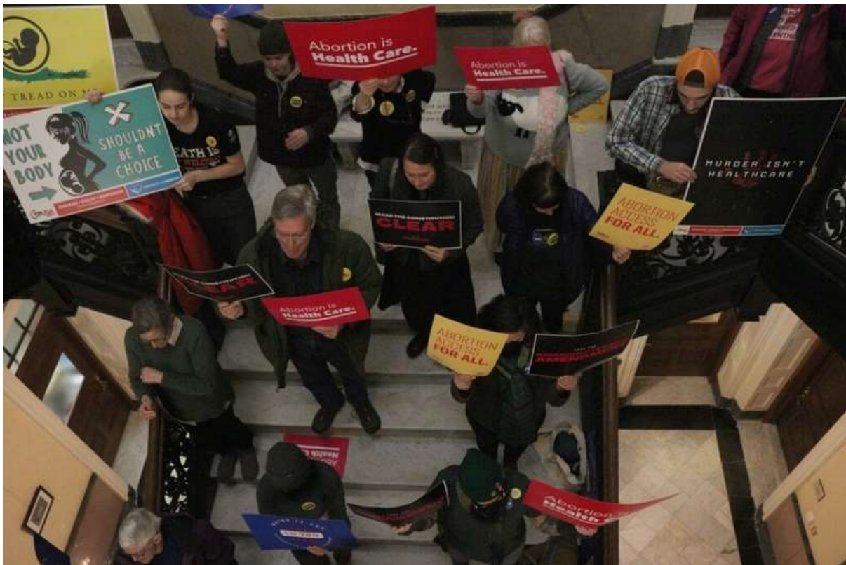
The Maine House held a public hearing for an abortion proposal on Jan. 22, the 51st anniversary of Roe.