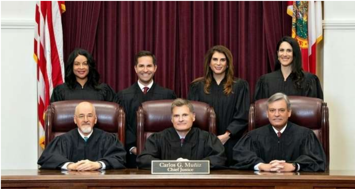
The Florida Supreme Court comprises justices appointed by Republican Gov. Ron DeSantis, a strident abortion opponent.