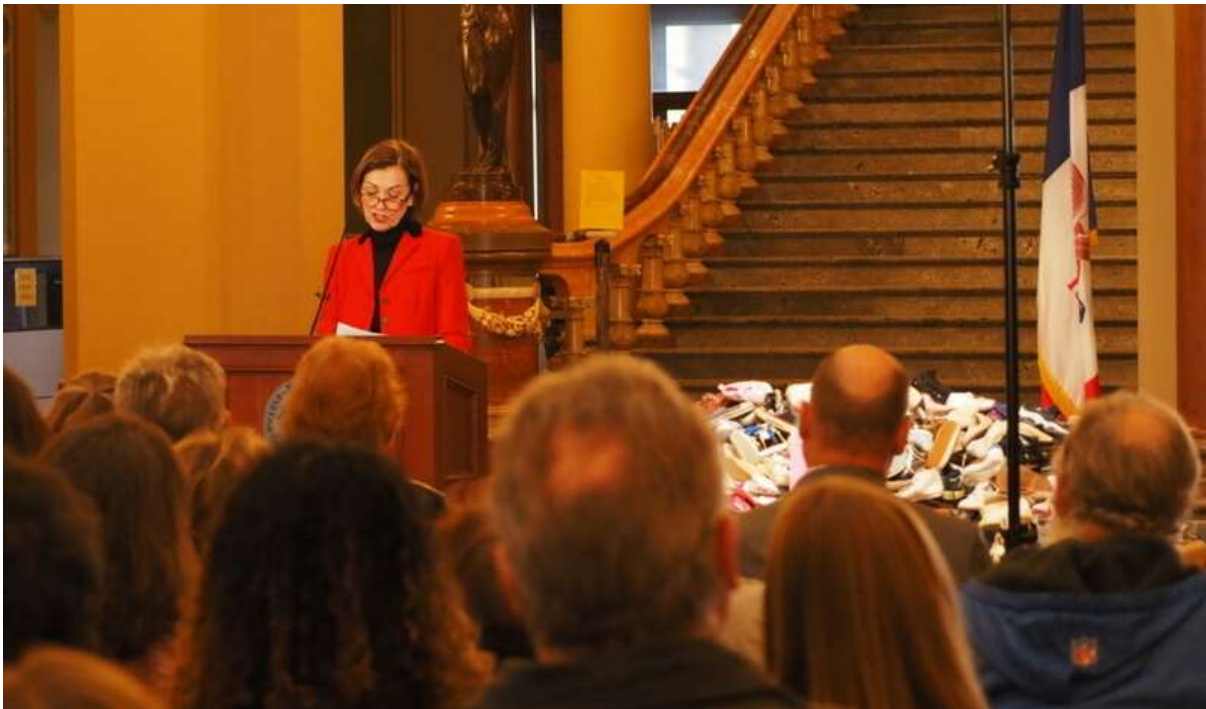
Iowa Gov. Kim Reynolds pledged to help new mothers at the Prayer Rally for Life on Jan. 22, 2024.

Republican leaders in Iowa marked the 51st anniversary of Roe v. Wade by hailing the anti-abortion legislation they passed last year.