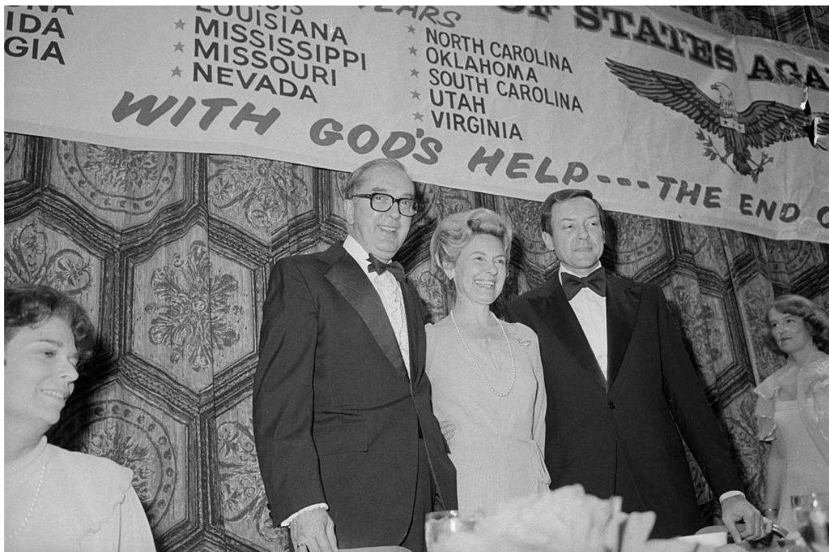
Former U.S. Sen. Jesse Helms (R-North Carolina) with conservative activist Phyllis Schlafly and former Sen. Orrin Hatch (R-Utah) at an anti-Equal Rights Amendment dinner in 1979. A provision named after Helms bans the use of U.S. foreign aid for abortions.

Sunday marked the 50th anniversary of a provision that prevents U.S. foreign assistance funds from being used for abortions.