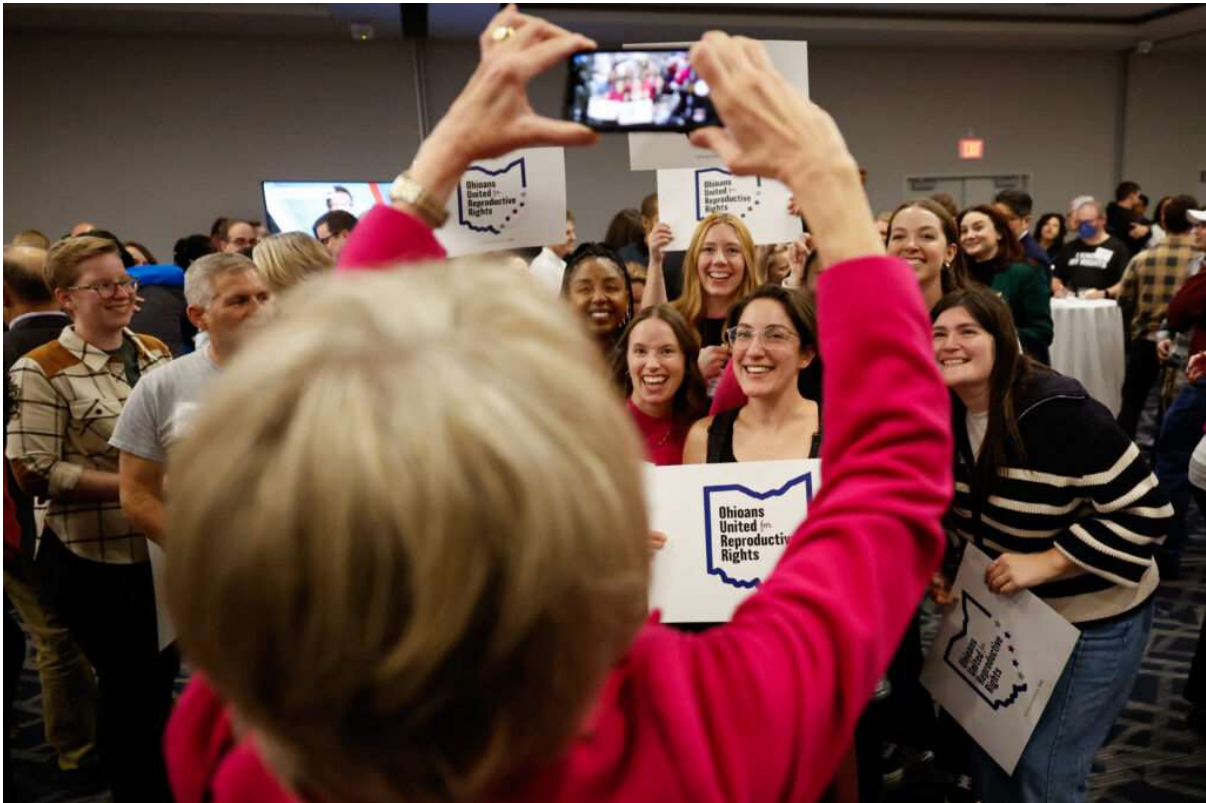
Supporters of the reproductive rights ballot measure Issue 1 celebrated on election night. Abortion rights advocates are urging the courts to strike down a six-week ban.

The American Civil Liberties Union, Planned Parenthood Federation of America and the WilmerHale law firm filed a request last week seeking to amend their lawsuit against Ohio's six-week ban. They said a reproductive rights amendment that officially took effect Dec. 7 means the restriction should be taken off the books, Ohio Capital Journal reports.