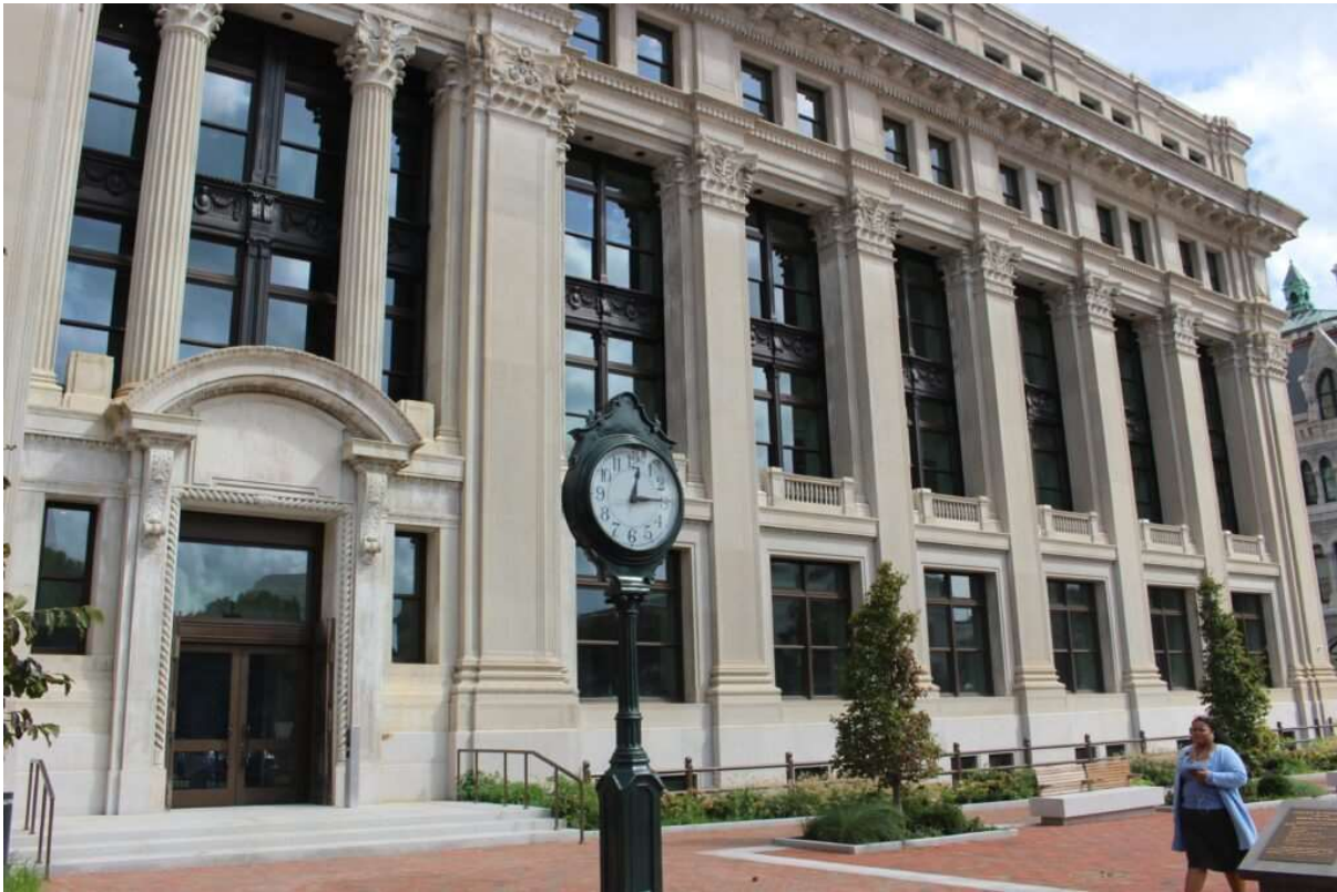
The historic facade of Virginia's General Assembly Building in Richmond. Democrats, who ran on reproductive rights this election cycle, recently won control of the House of Delegates and held the Senate.

Oklahoma Attorney General Gentner Drummond filed a federal lawsuit Monday against the Biden administration after the U.S. Department of Health and Human Services withdrew $4.5 million in Title X funding from the state . HHS reallocated the funds to abortion rights groups like Planned Parenthood after the state, citing its restrictive abortion law, refused to provide abortion counseling at federal reproductive health clinics , Oklahoma Voice reports. The state bans most abortions.